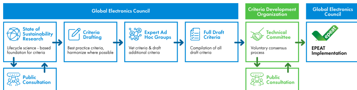
Figure 2: Steps in Criteria Development Process